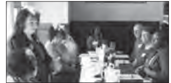
Lupus activist Rachelle Roy