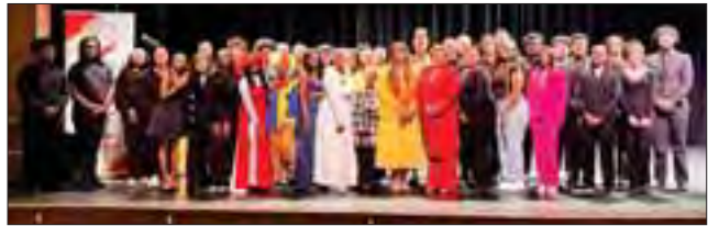
Debutantes, NANBPWC members, family, and supporters