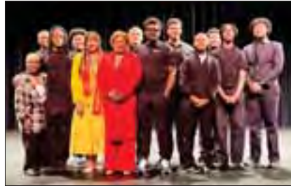
The 2026 Escorts

To learn more visit The Toledo Club NANBPWC, Inc. Facebook Page or the organization's national website at nanbpwc.org .