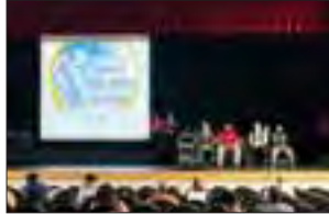
The Getting Your Affairs in Order panel