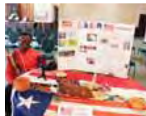
Success from Liberia