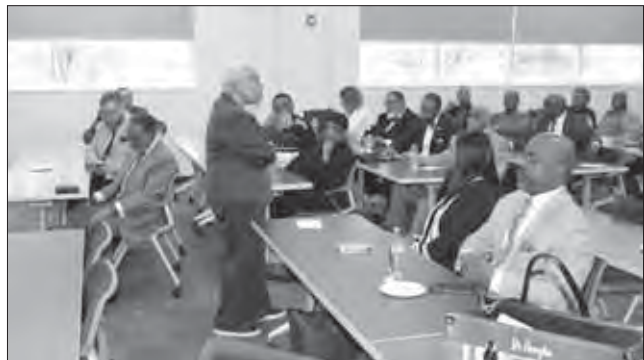
State Sen. Paula Hicks-Hudson opens the event