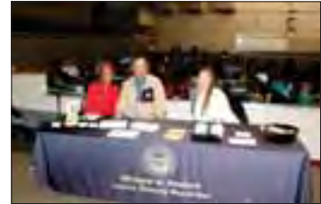
Lucas County Recorder's Office staff