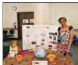
Nsuwa from Mozambique