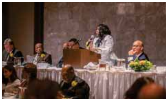
First Lady Debra Brock