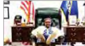
Trying out the new office and desk