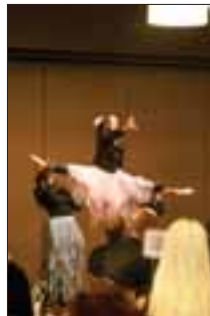
Mt. Nebo Praise Team