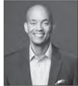
Black Out Loud author

Jack Benny Show ) eased the roles of Black characters into that of friends, rather than domestic workers. Black comedians began recording their acts on LPs, as they moved from live stage to small screen. Some landed their own TV shows, changed popular sketch programming, and made fun of white America right under white America's noses.