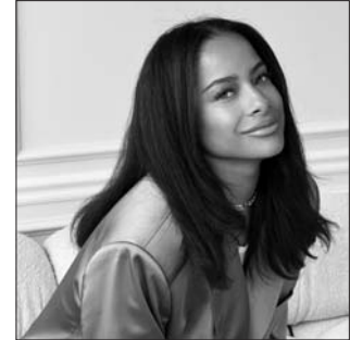
Outsider Advantage author

This book is an inspiration – especially for readers whose dreams are burning with ideas but not a lot of coin. The Outsider Advantage is for when the drum beat of entrepreneurship is just too irresistible.