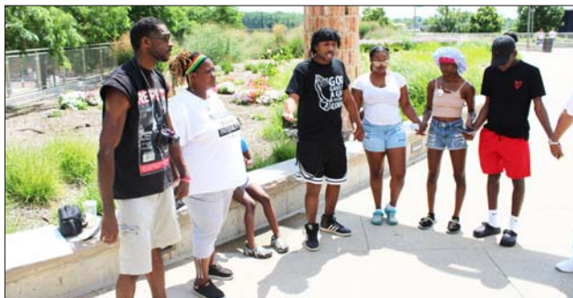
Praying before the march