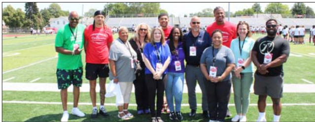
CareSource camp staff and athletes