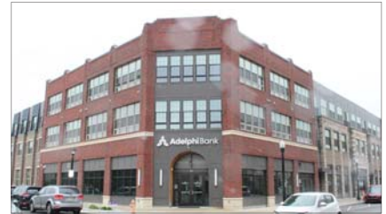
Columbus's Black owned bank, The Adelphi

frican American enclave's population had dropped to 16,000 and the area reeked of "vacant lots, broken buildings and higher crime," he told his Toledo