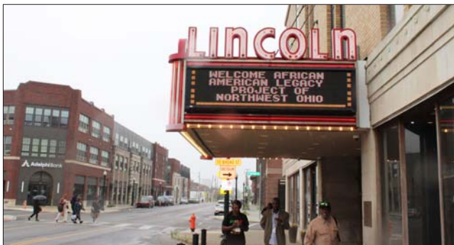
The Lincoln Theatre marquee