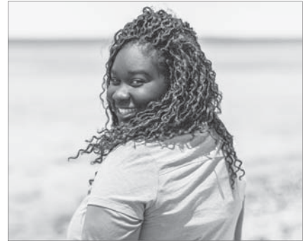
Sharks Don't Sink author