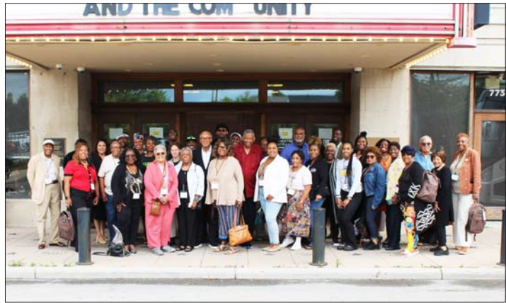
The Toledo Visitors