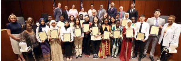
ACES Students honored by Toledo City Council