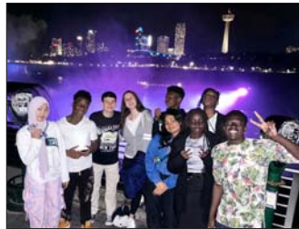
ACES students in Niagara Falls