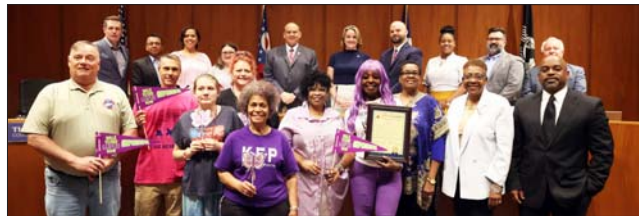
Lupus activists honored by Toledo City Council