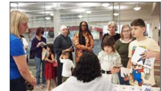
Participants line up to check out 'human books' at the Toledo Main Branch Library