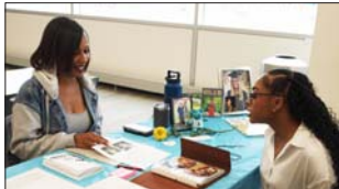
There were 22 human books on display at the Main Branch Saturday April 27