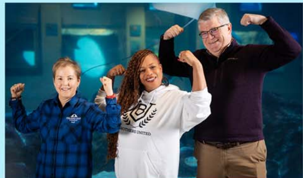
Strong Fathers Build Strong Families