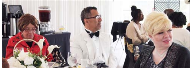
Attendees at the inaugural Alpha Beautillion held at the Toledo Museum of Art Glass Pavillion