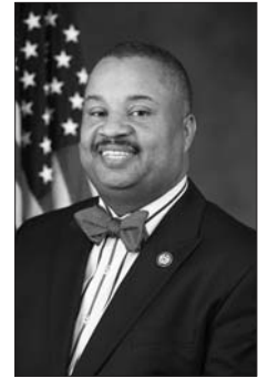
Congressman Donald Payne