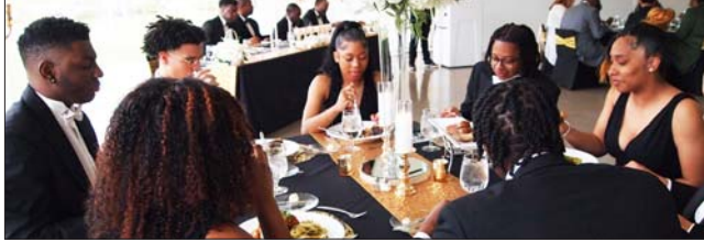
2024 Beaus, Junior Beaus and Belles enjoy dinner at TMA's Glass Pavillion