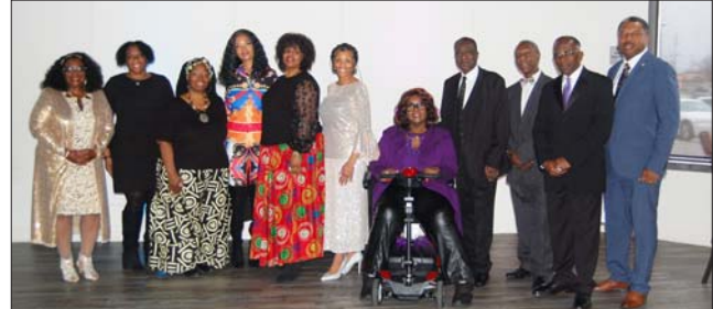
Honorees and UNB Board members