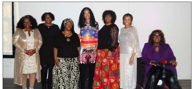
Mothers of Civilization Award Honorees