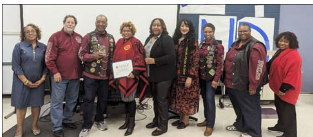
Toledo's Buffalo Soldiers and the NANBPWC, Inc, Toledo Club